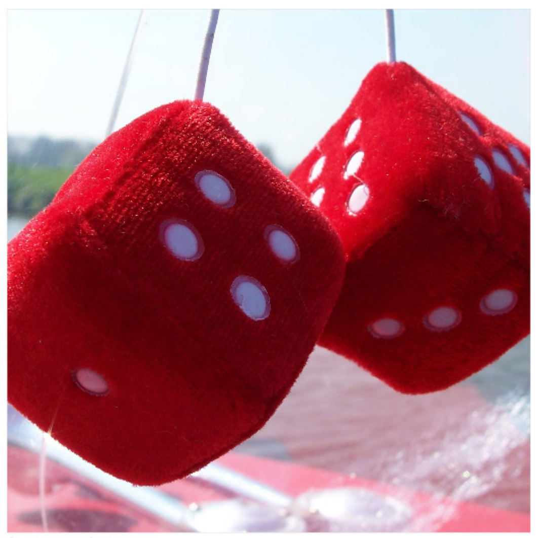
Spooled File Conversion